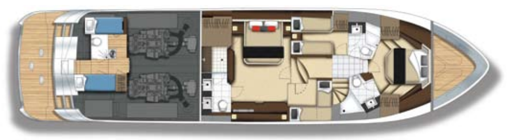
Fourth Stateroom with Double Crew Quarters