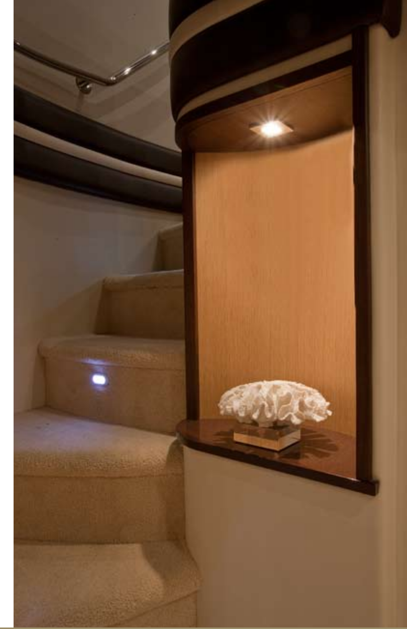
720 Fly Galley