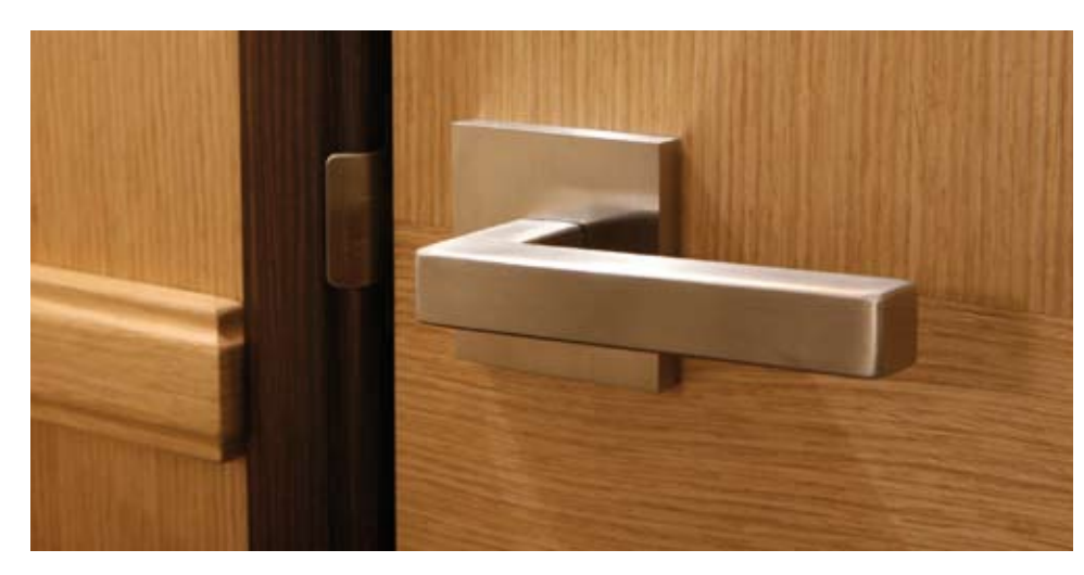
Visit www.marquisyachts.com to view expanded product portfolio.